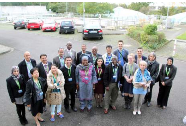
Participants during the study tour in BIBB

BIBB conducts research on initial and continuing TVET and its progressive development. A presentation was given on the institute's role within the German TVET system, the dual training system itself and the training regulations for selected green job profiles. This theoretical introduction to the German training system and how the concept of sustainable development is progressively translated into green jobs, was combined with a visit to a water treatment plant where the participants had the opportunity to speak to apprentices and learn about the water treatment and filtration processes.