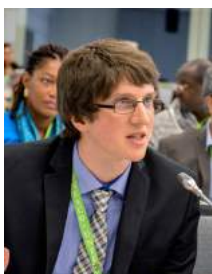
Wouter de Regt UNESCO-UNEVOC