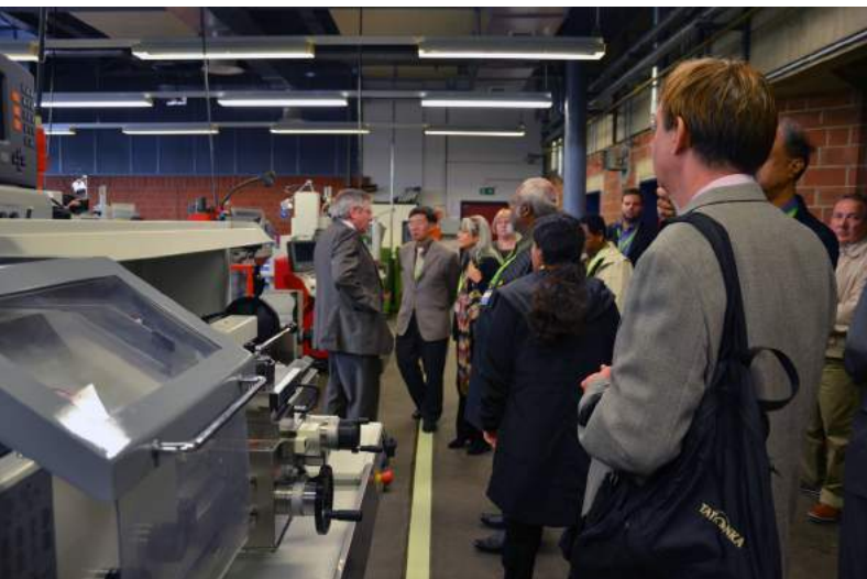
Study visit in Icon Institute

The tour continued with a visit to a training centre (BGE) managed by the Chamber of Crafts and Trade Aachen. The institution offers courses certified with the German Meister degree (equivalent to a Bachelor degree) and other specialized training courses.