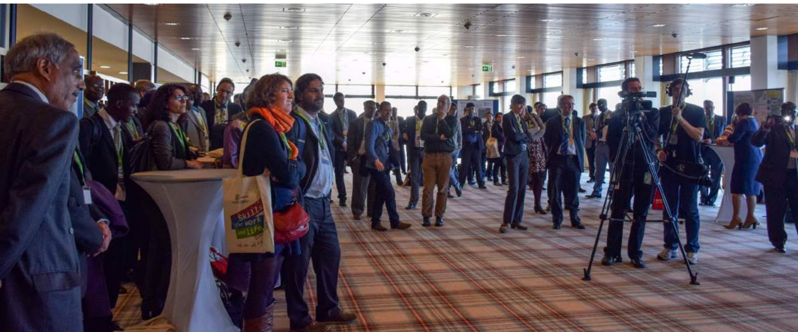
Participants during the UNEVOC Network Session