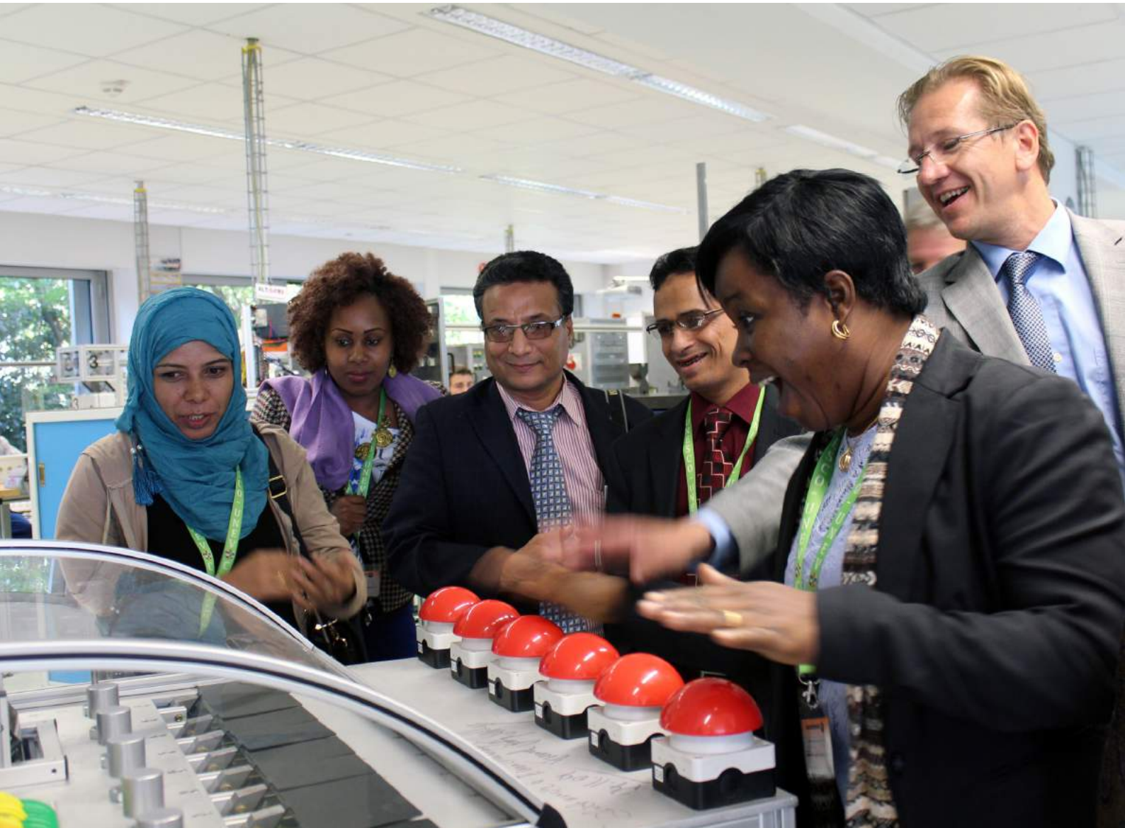
Delegates during one of the study tours