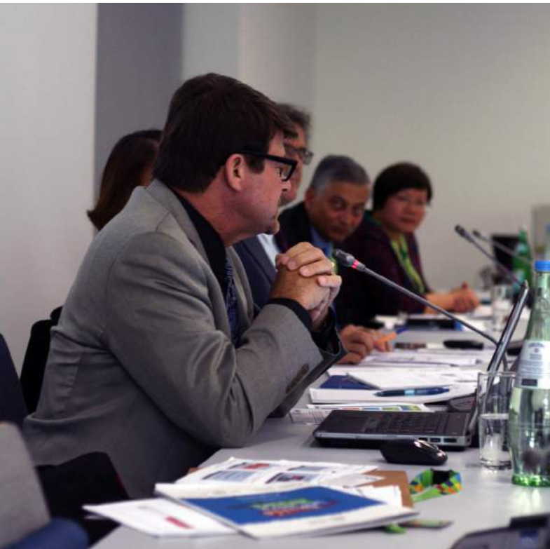
Panelists of the session

Greening TVET is part of a transformative and inclusive vision for TVET as outlined at Shanghai. It represents a more systemic approach to all TVET activities than a mere economic approach. It aligns with local economies, covering both formal and informal enterprises and work. It guides stakeholders in the framing of skills development according to available occupational requirements, addressing questions of what skills and workforce education programmes are needed; what proficiency levels should be set for what jobs and work processes; and what qualifications should be the focus of investments. Thus, it symbolizes a continuous process towards attaining low-carbon green growth.