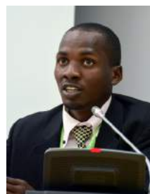
Arnest Sebbumba Countryside Youth Foundation, Uganda