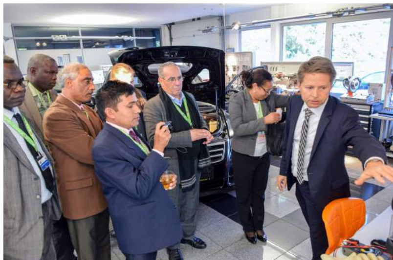
Study visit in Lucas Nülle

'We are trying to make the technology visible for the student – we have to be able to adapt our products so we can make sure we are prepared for the technology of tomorrow', said a LN representative.