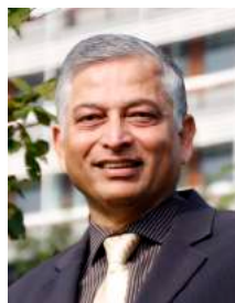
Shyamal Majumdar Head, UNESCO- UNEVOC International Centre for Technical and Vocational Education and Training