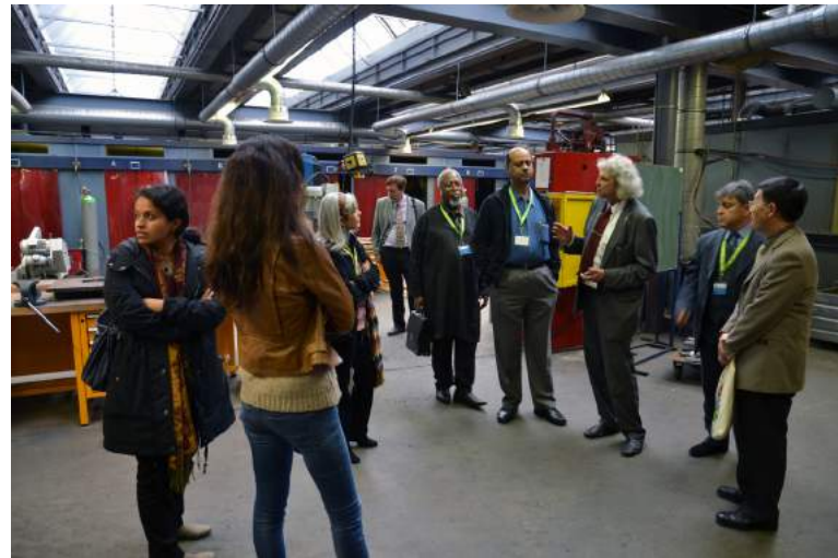
Participants during study visit

agenda. The Sustainable Development Goals (SDGs) underpinned multidisciplinary discussions at the forum and represented an important step forward in development thinking by bringing together sustainable development with poverty alleviation, inequality and technological change in a holistic account of how people's lives can be enhanced.