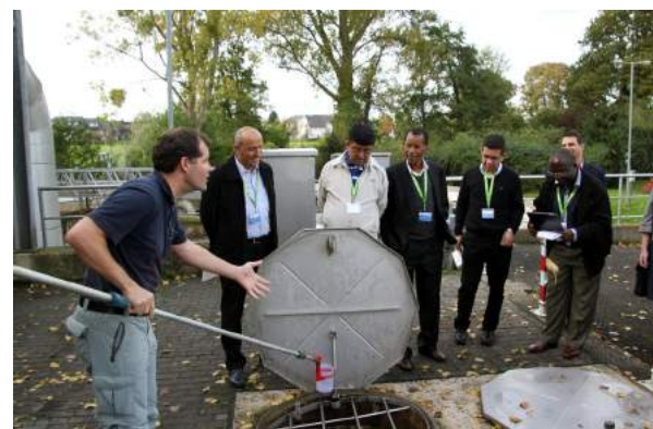
Study visit in DWA