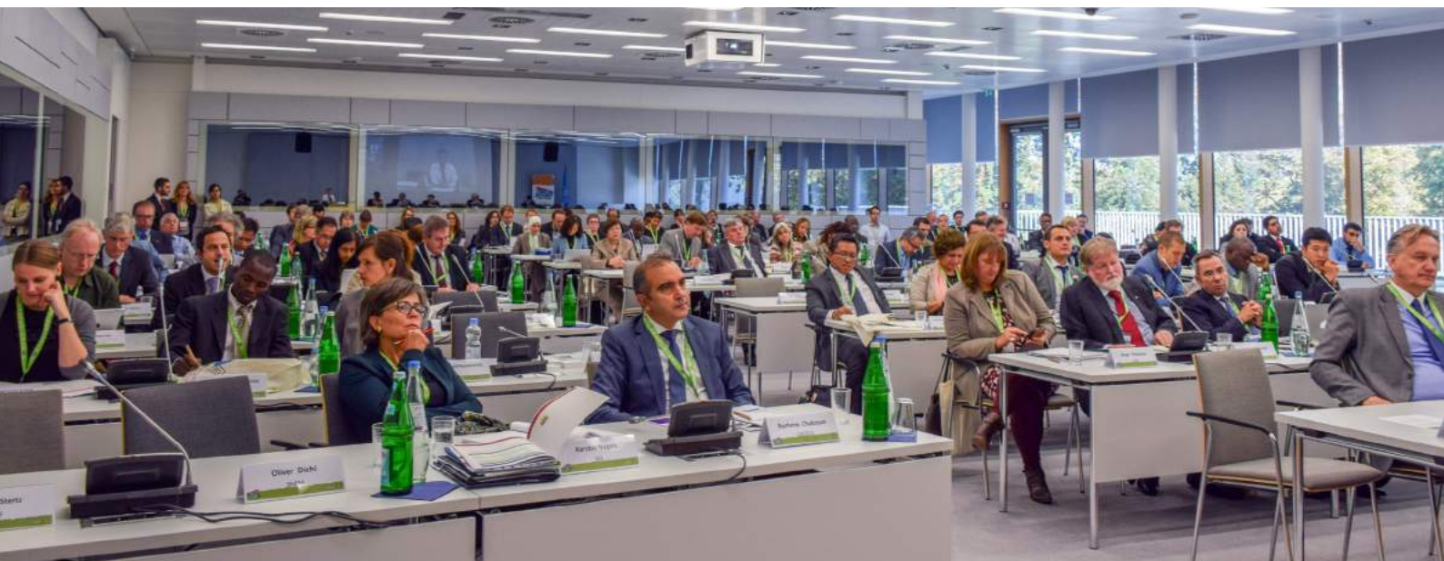
Participants of the Global Forum