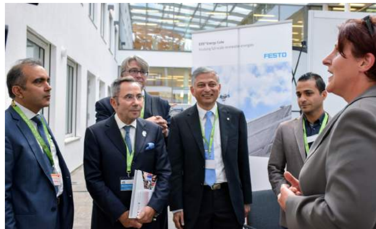
During the exhibition opening