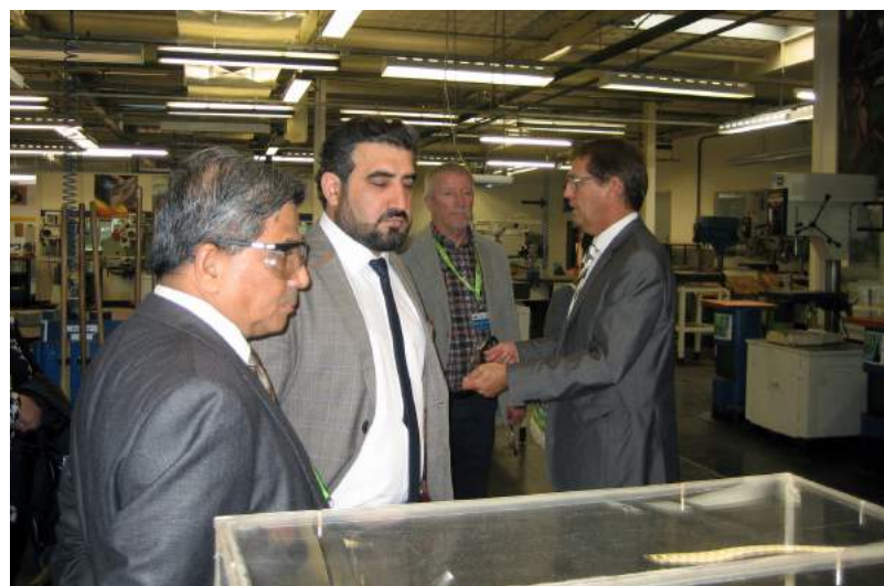
Study visit in Ford Ford Aus- und Weiterbildung e.V.

Besides a comprehensive introduction to the German dual training system and FAW's role in providing in-company training, a special emphasis was given to the company's programme targeting vulnerable youths and its campaigns to attract female apprentices for jobs that are traditionally dominated by men.