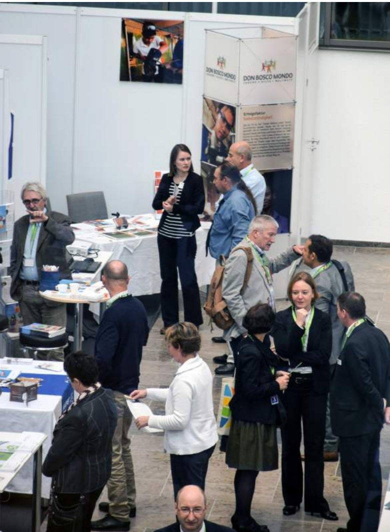
Participants visiting exhibition booths