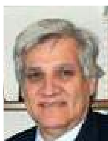
Juan Carlos Villagrán de León Head, United Nations Platform for Space-based Information for Disaster Management and Emergency Response UN- SPIDER, United Nations Office for Outer Space Affairs (UNOOSA)