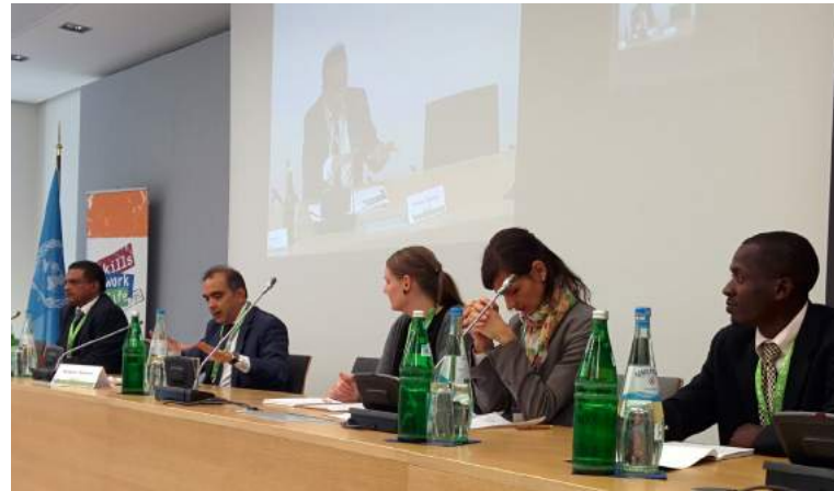
Panelist with youth representatives from Germany and Uganda

stakeholders. To achieve this, the quality and relevance of courses must be strengthened and improved. Mr Samuels argued that people will not look favourably on TVET institutions if their quality is not good or if they do not provide skills that make people effective in the labour force.