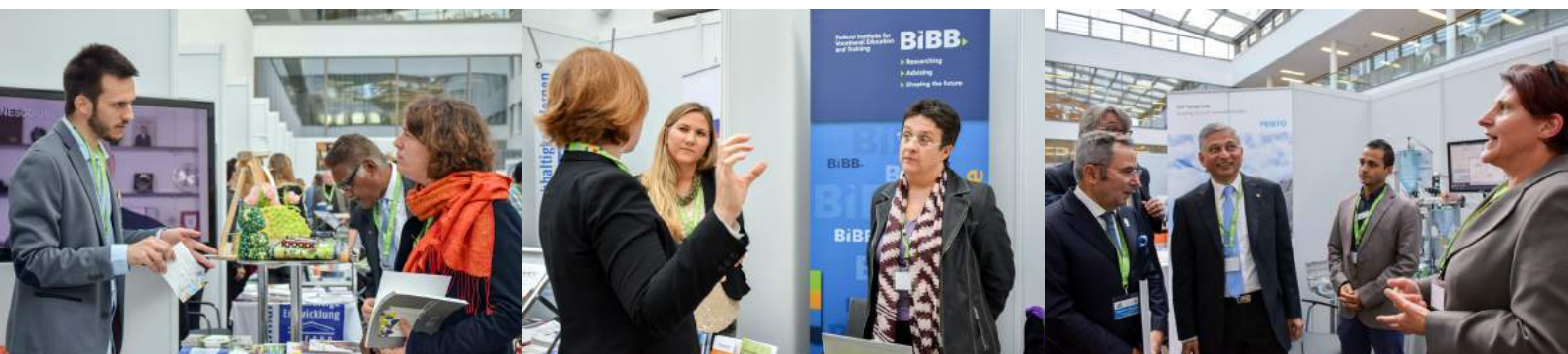
Global Forum exhibition

This report documents the discussions for further informing the global debate on TVET and the post-2015 agenda. It describes the approach in which the forum utilized cross-regional networking and partnership as platforms to create synergy and make TVET contributions relevant to the fulfilment of the aims of the post-2015 education agenda and its implications for the SDGs.