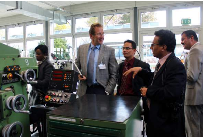
Study visit in Currenta